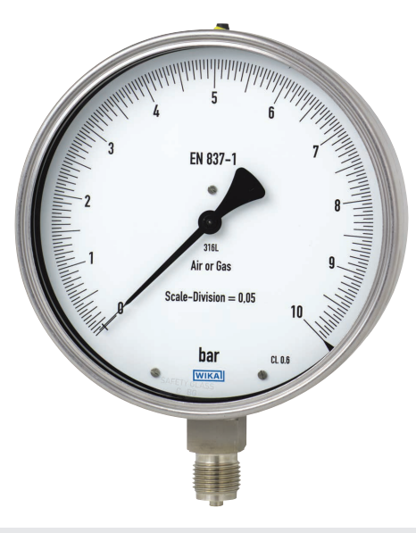
Test gauge, stainless steel, model 332.50